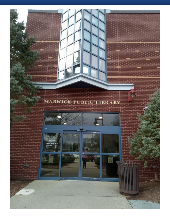
Today I am going to Sensory Play at the Warwick Library. This is the library entrance.